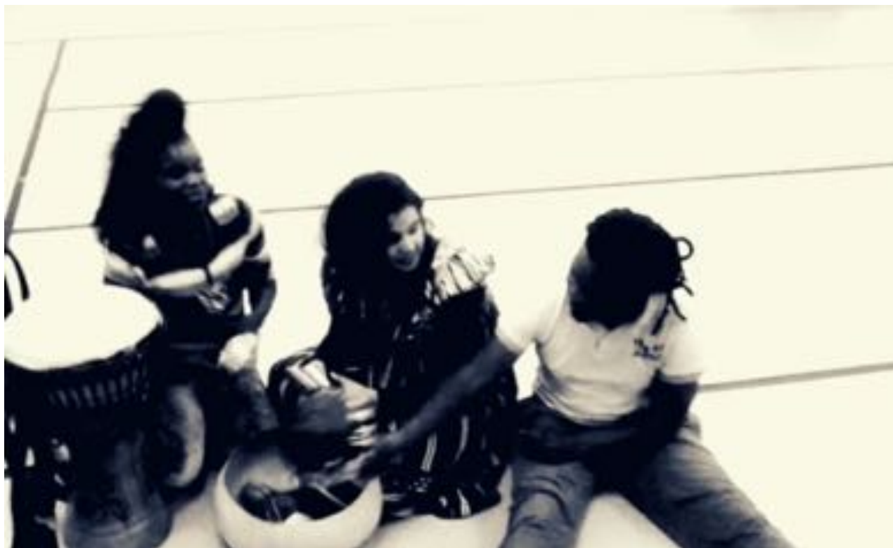
IARL - experiences