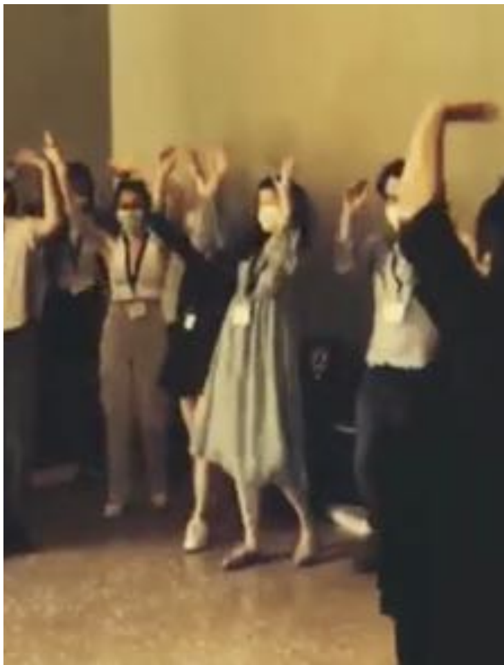
IARL at the National Conference of Legal Clinics - Naples 2022

120-23/04/2022, Reggio Calabria – Palmi (Italy) - Festival Nazionale di Diritto e Letteratura IX ed. The ninth edition of the National Festival of Law and Literature took place from April 20 to 23. "Dagli all'untore! Law, literature, epidemics" is the title of this year's event.