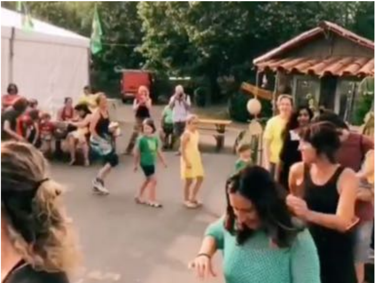
IARL - experiences