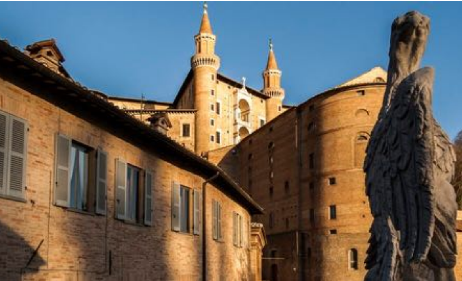
View of Urbino

Dear ISLL Members and Friends, we are pleased to summarize the most interesting initiatives that took place in 2022, with some previews of ones to come.