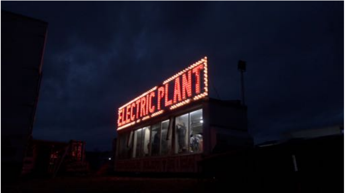
La carovana bianca, 2021