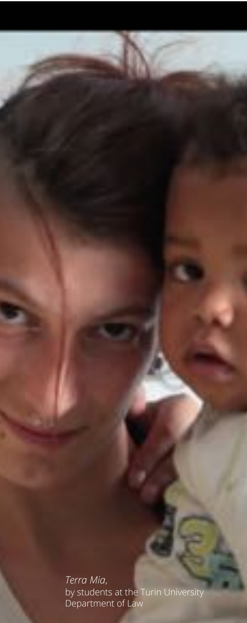
Terra Mia, by students at the Turin University Department of Law