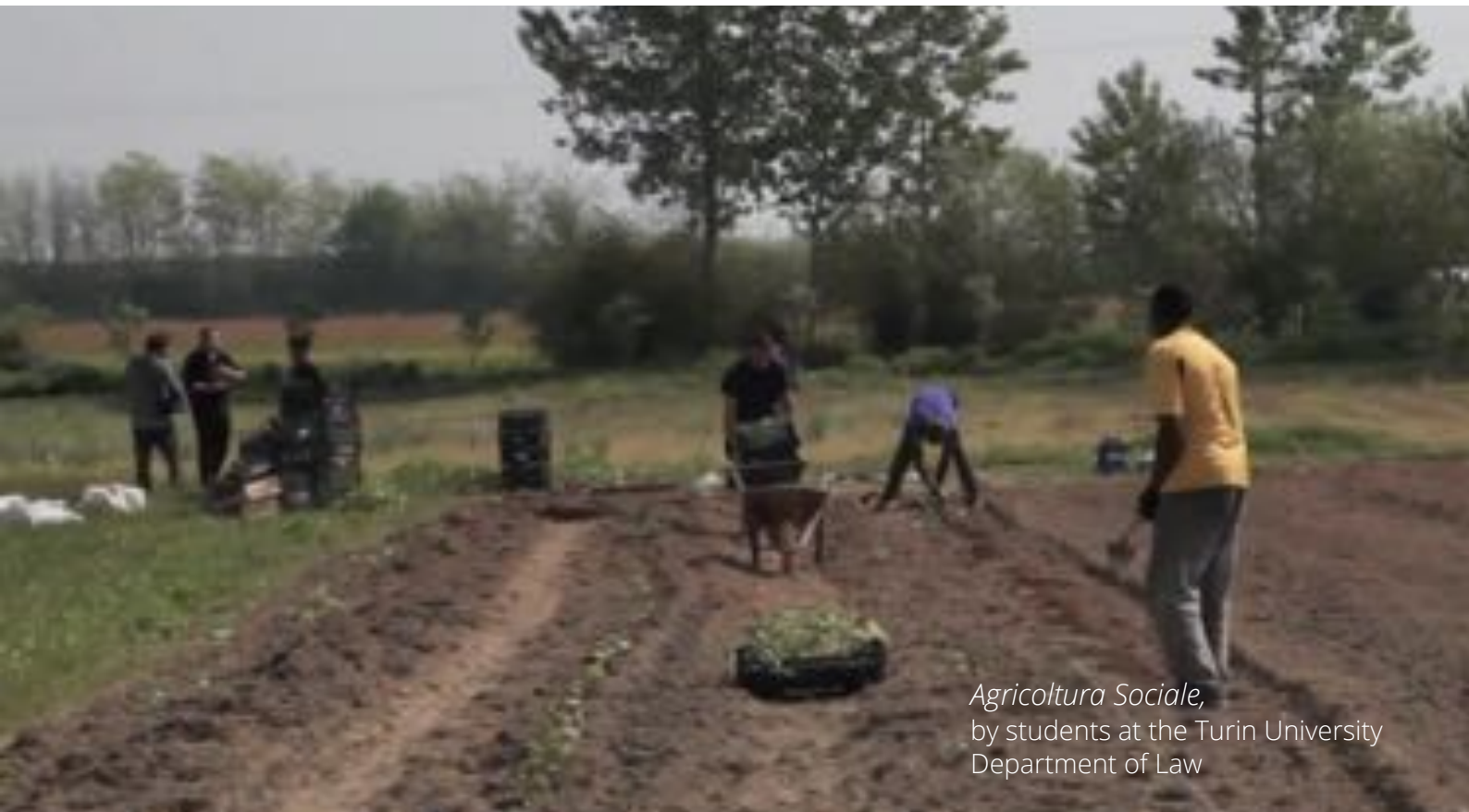
Agricoltura Sociale, by students at the Turin University Department of Law